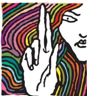
Hungarian Helsinki Committee