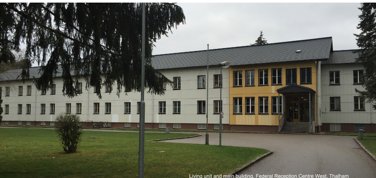
Living unit and main building, Federal Reception Centre West, Thalham

One initial reception centre (EAST) and one distribution centre (VQ) were visited as part of ECRE's study visit; a short description of each centre is set out below.